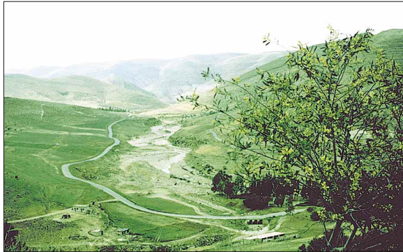
Course of Wadi Wala across Jordan Rift Valley Escarpment

Flow characteristics of the Wadi Wala are measured at Karak Road, where the drainage area is 1,800 km 2 . The Wadi Wala has fairly stable baseflow that typically provides from 0.1 MCM per month during the summer to more than 1 MCM per month during the winter, as shown in the graph of median monthly volume to the right. The drainage area of the Wadi Wala at Karak Road is less than half that of the Wadi Mujib at Karak Road; however, baseflow of the Wadi Wala is slightly greater than that of the Wadi Mujib. This is mainly because average annual rainfall in the Mujib watershed is about one-half that of the adjacent Wala watershed. Zero flow conditions have been observed at the Karak Bridge gage during summer months in only 3 years—1990, 1995, and 1996. The largest observed floods on the Wadi Wala occurred in April 1971 and February 1992, with discharges of 245 and 248 m 3 /s, respectively.